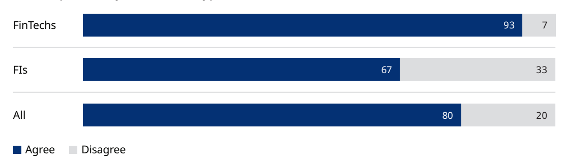
Exhibit 10: Usefulness of synthetic data for AI model training

By harnessing these innovative solutions, we can move closer to resolving the data scarcity challenge and fostering responsible data sharing practices, so as to further drive the development of more AI solutions from AI FinTechs and FIs.